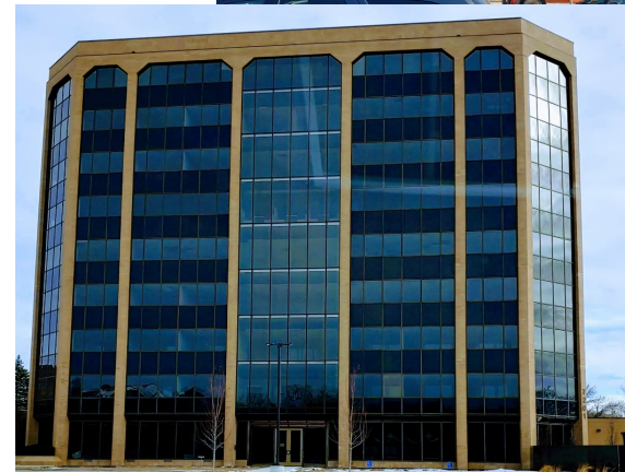
Top: Installing panels for curtain wall