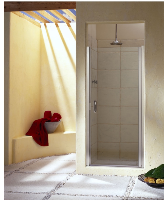
Above: Brin comes through for the homeowner with quick problem-solving on a shower door for this bathroom remodel.