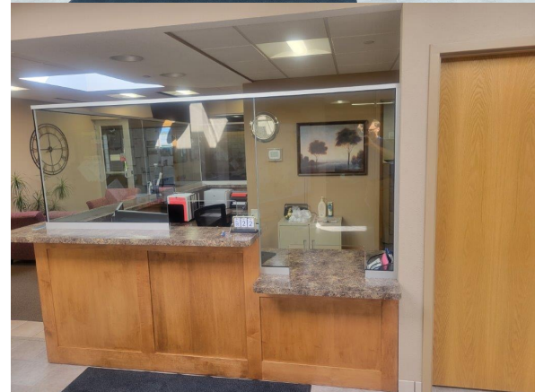
Top Image: Front desk, before Bottom Image: Front desk, after