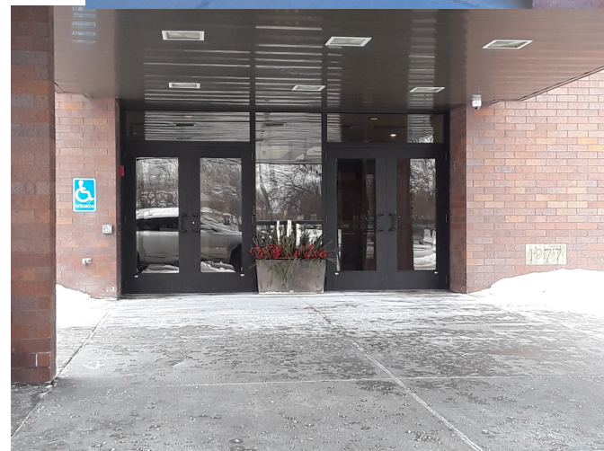
Top Image: Front Entrance Before Bottom Image: Front Entrance After