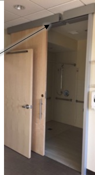
Right: Heartland Glass devised a solution in the field to combat a hospital room design obstacle (lift tracks intersected the barn door tracks for the bathroom).