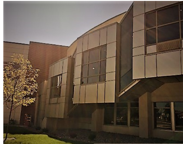
Above: Brin provided glass for the interior and exterior of the hospital.